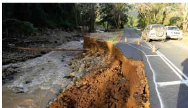
Flood damage on Murphys Creek Road

The reconstruction works will be undertaken throughout the Lockyer Valley and Ipswich regions within the next three years.